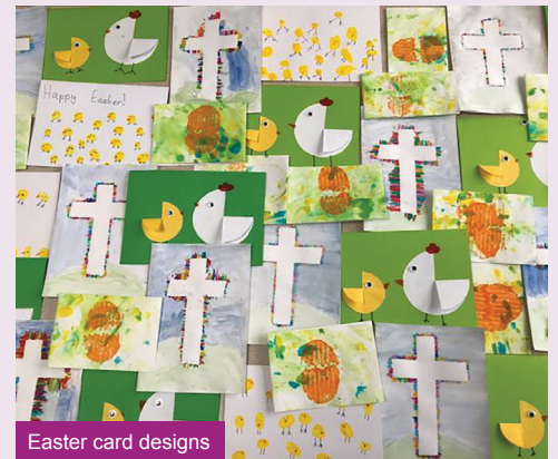
Easter card designs

These were distributed with chocolate goodies to SVP beneficiaries and one of the care homes in their area.