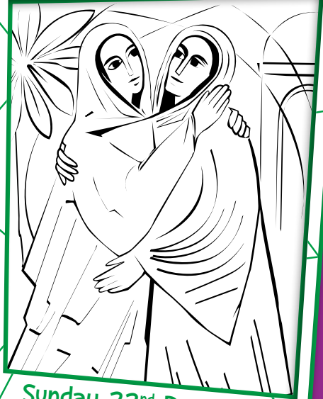
Sunday 22 nd December