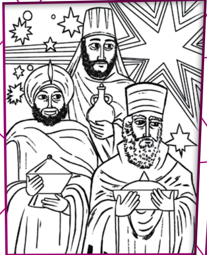
Sunday 5 th January