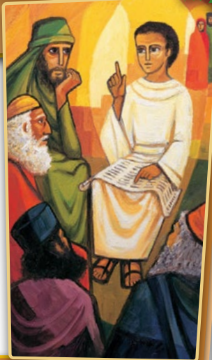
From the Gospel of Sunday 29 th December 2024 Luke 2:41-52 (the Feast of the Holy Family, Year C)

Every year Joseph and Mary went to Jerusalem to celebrate the feast of the Passover. When Jesus was twelve he went with them. After the feast, on the way home, Mary and Joseph realised that Jesus was missing from the group. So they went back to Jerusalem to look for him. After three days, they found Jesus in the Temple, listening to the teachers and asking them questions. The teachers were amazed at his intelligence. His parents were overcome when they found him and told him how worried they had been. "Why were you looking for me?" asked Jesus. "Did you not know that I would be in my Father's house?" Then Jesus went back home to Nazareth and lived in obedience to his parents. He grew in wisdom and grew in favour with God and the people.