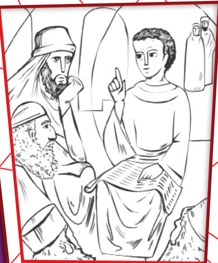
Sunday 29 th December