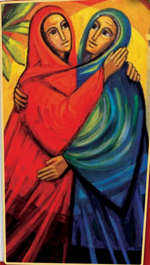
From the Gospel of Sunday 22 nd December 2024 - Luke 1:39-44 (the 4 th Sunday of Advent, Year C)

Mary had been told by an angel that she was to give birth to a son named Jesus. When she heard that her cousin, Elizabeth, was also going to have a baby, she went as quickly as she could to visit Elizabeth. Mary went into Zechariah's house and greeted Elizabeth. Now as soon as Elizabeth heard Mary's greeting, the child leapt in her womb and Elizabeth was filled with the Holy Spirit. Elizabeth gave a loud cry and said to Mary, "Of all women you are the most blessed, and blessed is the fruit of your womb. Why should I be honoured with a visit from the mother of my Lord? For as soon as your greeting reached my ears, the child in my womb leapt for joy. Yes, blessed are you for believing the promise made to you by the Lord."